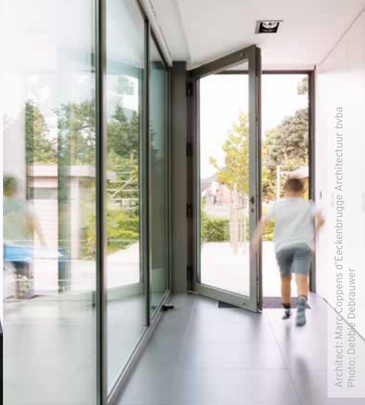
Architect: Marc Coppens d'Eeckenbrugge Architectuur bvba