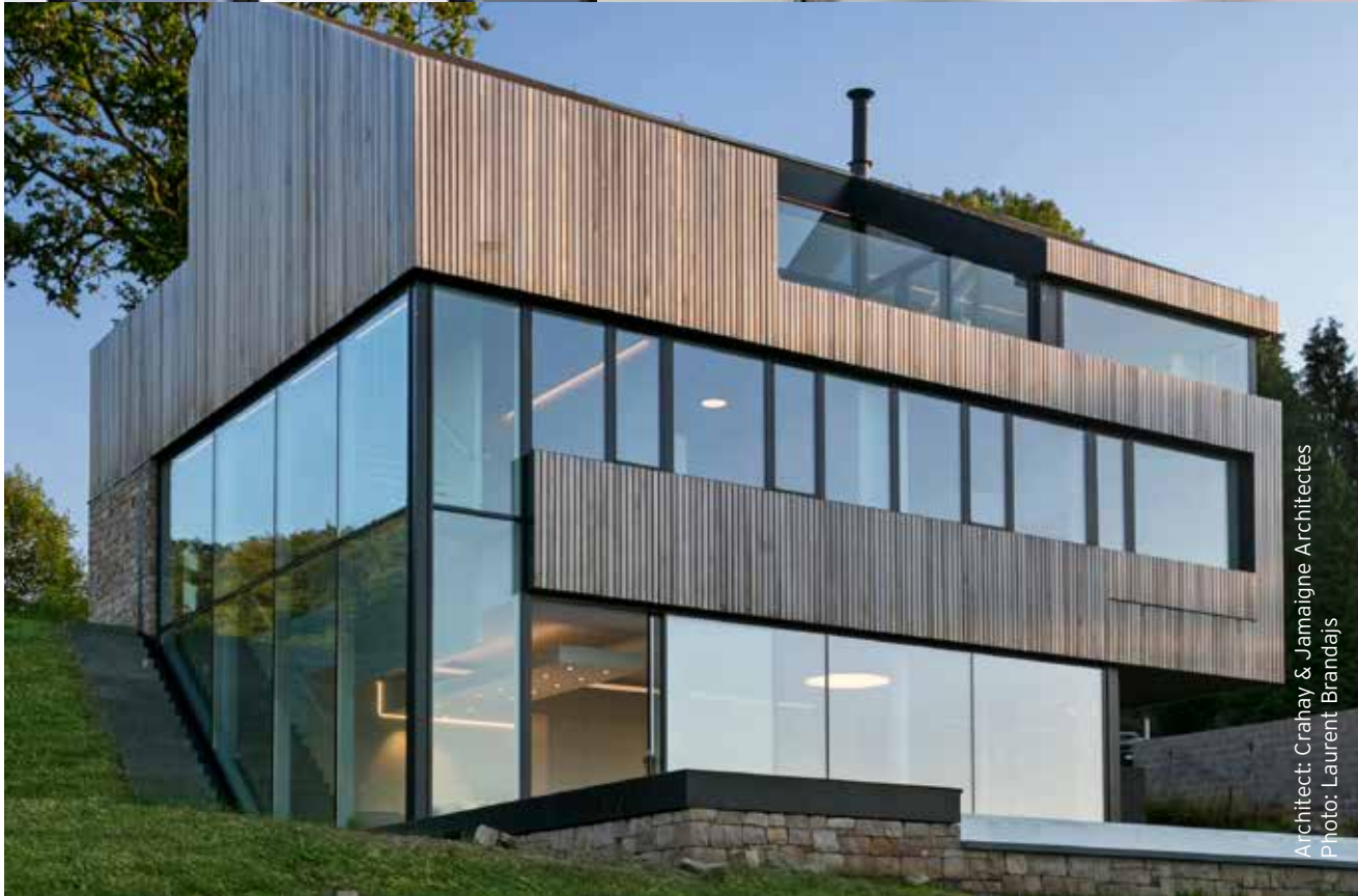
Architect: Crahay & Jamaigne Architectes